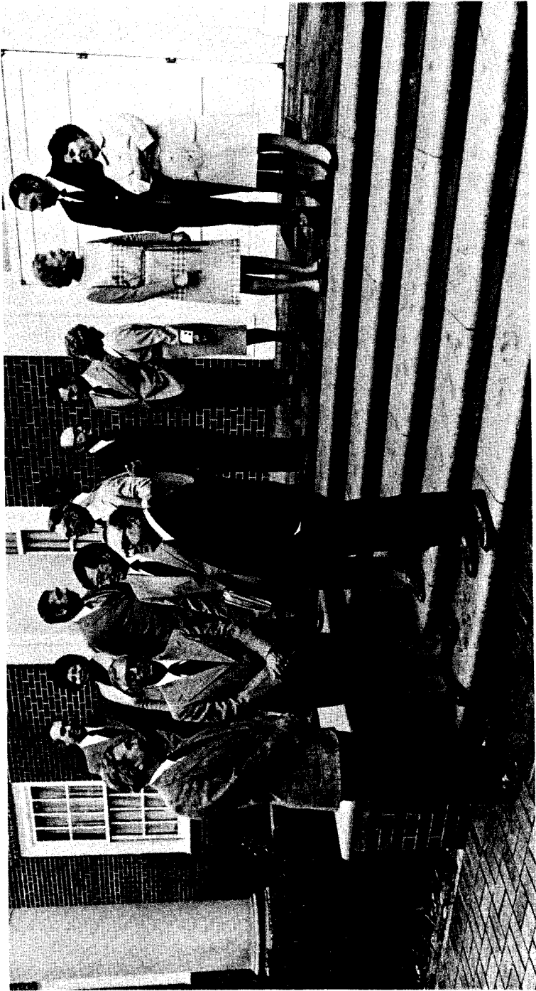
The State College Board of Trustees